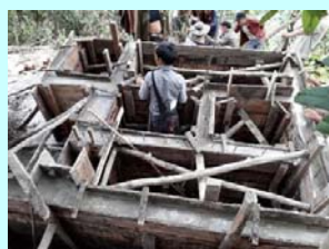
Pictures of water system construction in Naphieng village, Xamneua district, Huaphanh province

Lack of access to Water Sanitation and Hygiene (WASH) has both direct (e.g. diarrheal diseases, intestinal parasite infections and environmental enteropathy) and indirect (e.g. necessitating walking long distances in search of water and sanitation facilities and diverting a mother's time away from child care) impact on a child's nutritional status. These effects are recognized in the NNS and the NNSAP. SCALING aims to improve the capacity of Nam Saat as the department responsible for the supply of clean water in villages under the Ministry of Health, in two areas: improvement of sustainable water supply systems in selected villages and the marketing of selected WASH products. Under the WASH Marketing component households in the target areas are encouraged to invest in latrines and water filters in cooperation with selected private vendors and trained Community Sales Agents. The approach matches the government policy to make all villages Open Defecation Free (ODF) by 2023. In addition to the approach on marketing of selected WASH products the project has allocated budget for water system constructions in the target communities.