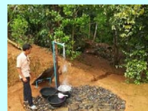
Pictures of water system construction in Khanoumnoy village, Phongsay district, Phongsaly province