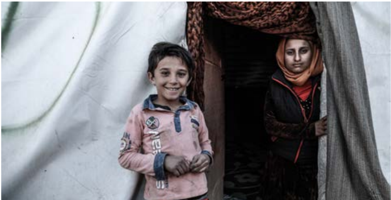
Mother and her boy in an ITS in Zahle, Lebanon. January 2017.

The adoption of the EU-Lebanon Compact, which foresees an EU allocation of at least €400million in 2016-17, in addition to bilateral assistance of more than €80million, was announced on 15 November 2016. In addition to financial commitments, the EU has also committed to increase support to private sector development in Lebanon, provide assistance to help Lebanese businesses take advantage of existing market access to the EU, and seek to reduce existing non-tariff barriers to goods and services.