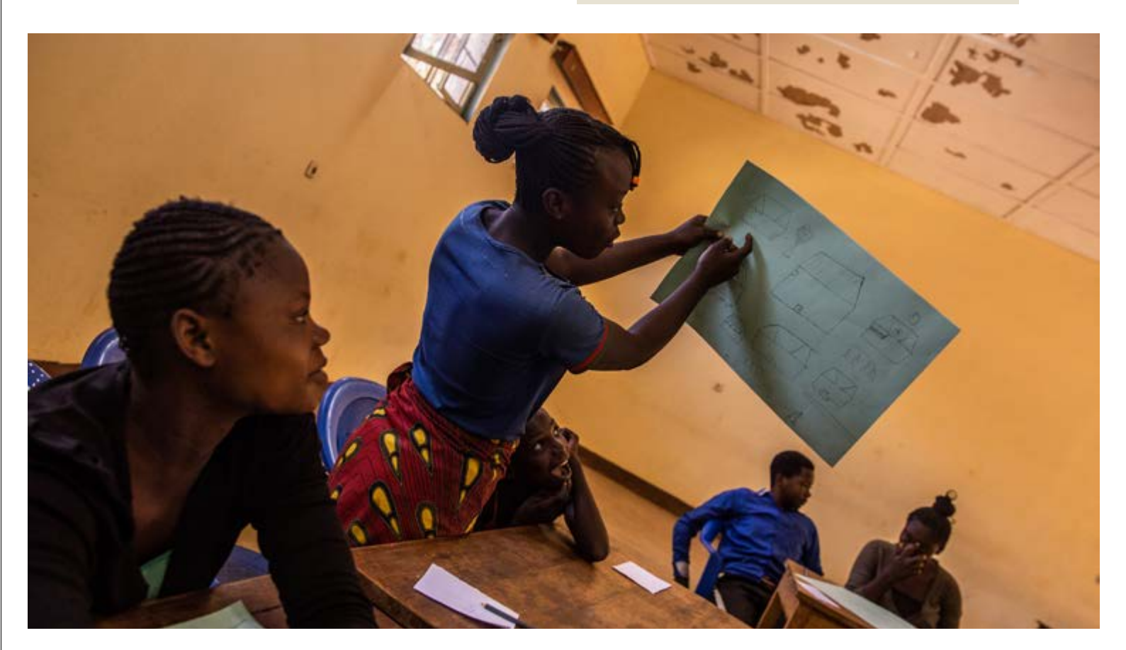
Children take part in a focus group carried out on behalf of Save the Children, intended to understand the scale and scope of child's rights violations in mining communities.