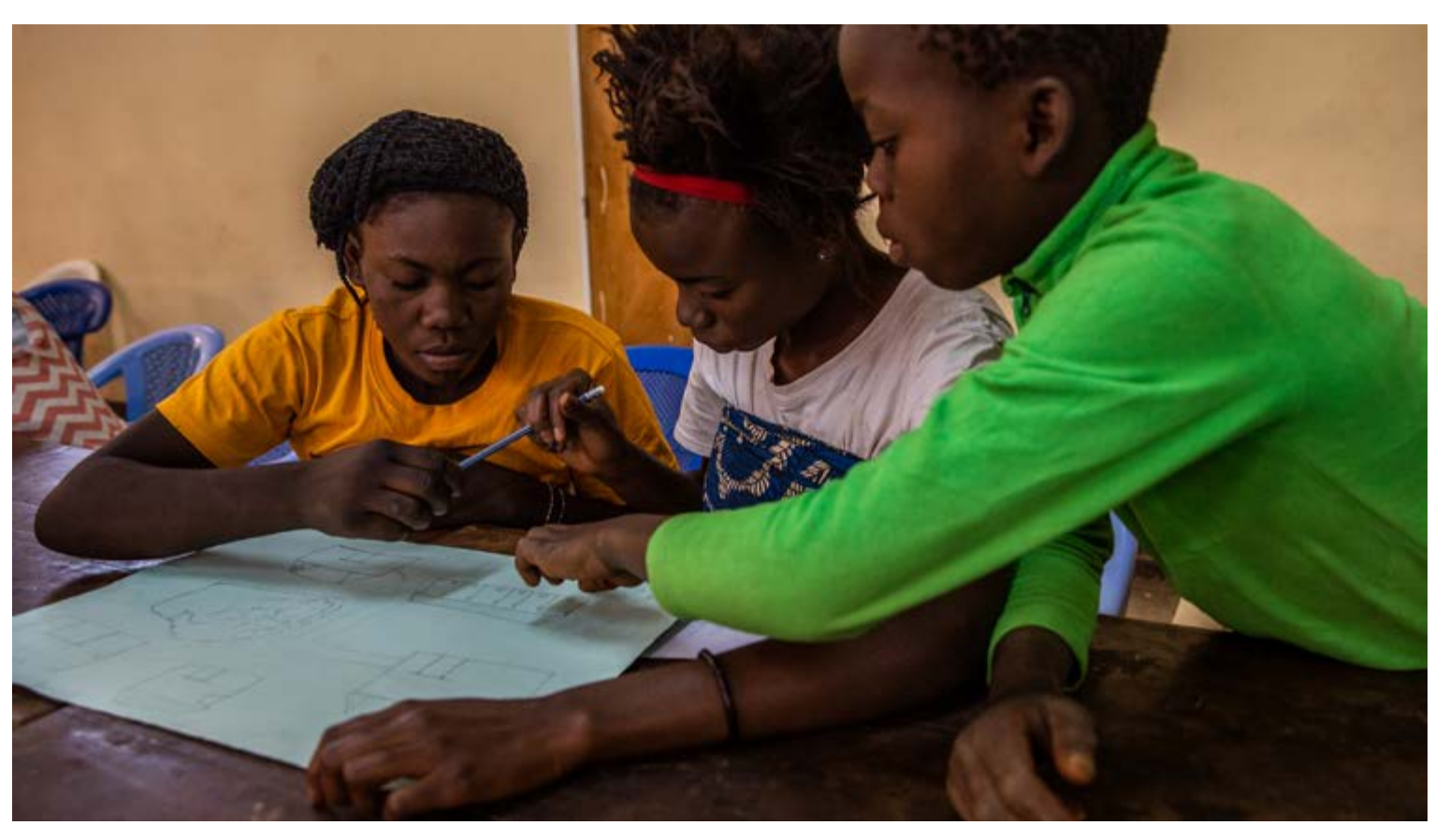
School children work on an exercise during a focus group activity organized as part of the study.

In the cobalt supply chain, upstream actors/players are those involved in the sourcing and extraction of cobalt from mines to the refineries.