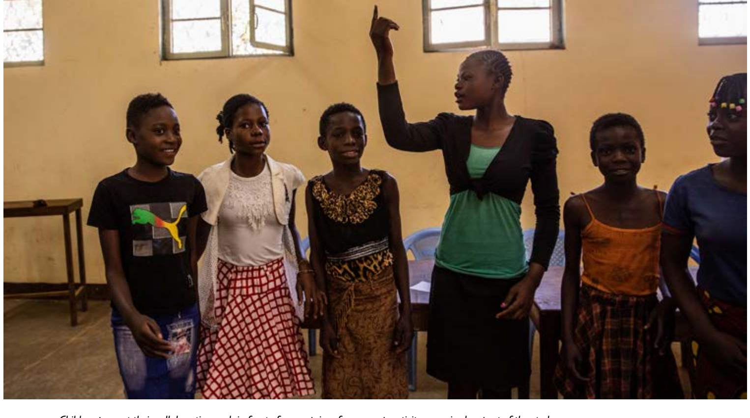
Children present their collaborative work in front of a group in a focus group activity organised as part of the study.

In 2020, a Fair Insurance Guide report found that nine of the largest insurance companies active in the Netherlands<sup>9</sup> invested over 14 billion USD in 23 of the largest manufacturing companies<sup>10</sup> in the world in the automotive, electronics and battery sectors that use cobalt in the products they manufacture (Fair Insurance Guide 2020). Further analysing the investments of the Dutch pension funds, we found that two of the largest pension funds in the Netherlands (ABP, PFZW) made their investments publicly available. Through the list of their investments, we found that between the two they invested over 18 billion Euros (over 21 billion USD) in 15 consumer brands listed in Table 1, who use cobalt in their products. All these companies except BMW currently source cobalt from DRC.