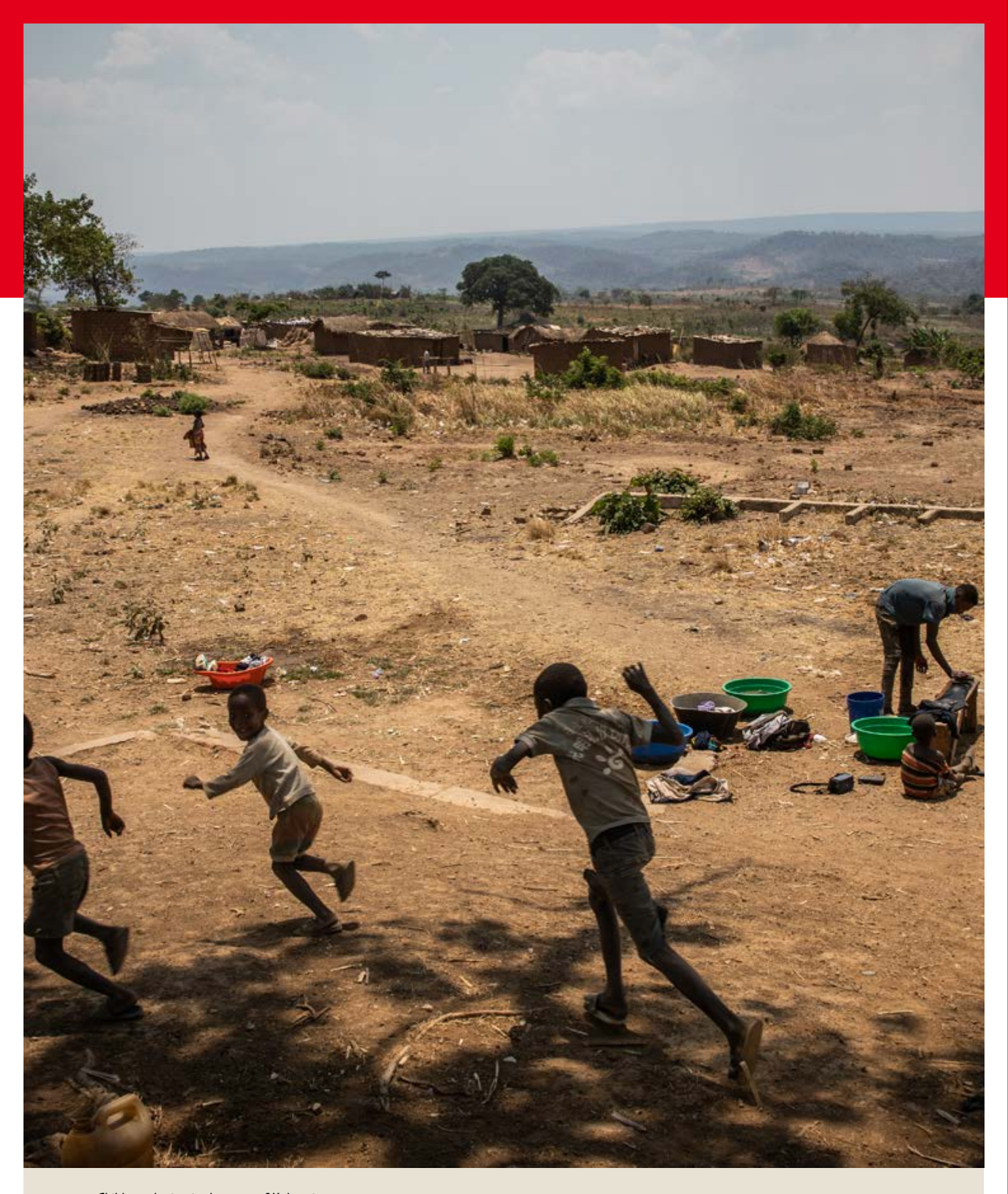
Children playing in the town of Kolwezi.