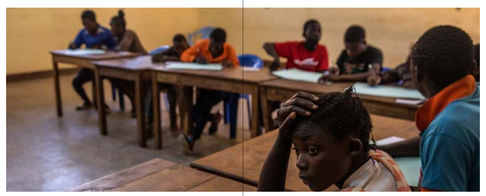
Children participate in the focus group.

Cobalt is not classified as a conflict mineral in legislation like the U.S. Dodd-Frank Act, and therefore any regulations aimed at curbing the illegal flow of conflict minerals does not apply to cobalt. The EU's new Conflict Minerals Regulation<sup>28</sup> that came in effect as of 1 January 2021 mandates due diligence as defined in the OECD Due Diligence Guidance<sup>29</sup> (PRI 2021), but there is no specific mandatory framework for cobalt. All the international standards that are listed in Box 3 apply to cobalt only on a voluntary basis, and as such create a regulatory gap for due diligence in cobalt, making it a choice of companies, and those that invest in them, as to what degree they