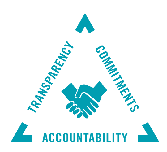
The accountability triangle, adapted from Oxfam.

The Equator Principles (EP) have become the financial industry standard for environmental and social risk management in projects. Financial institutions adopt the EP to ensure that the projects they finance are developed in a socially responsible manner and reflect sound environmental management practices. By doing so, negative impacts on projectaffected ecosystems and communities should be avoided where possible. If unavoidable, negative impacts should be reduced, mitigated and/or compensated for appropriately."54 Major Dutch banks, ABN AMRO, Coöperatieve Rabobank, De Volksbank, ING, FMO, NIBC Bank and NWB Bank are signatories of the EP.55