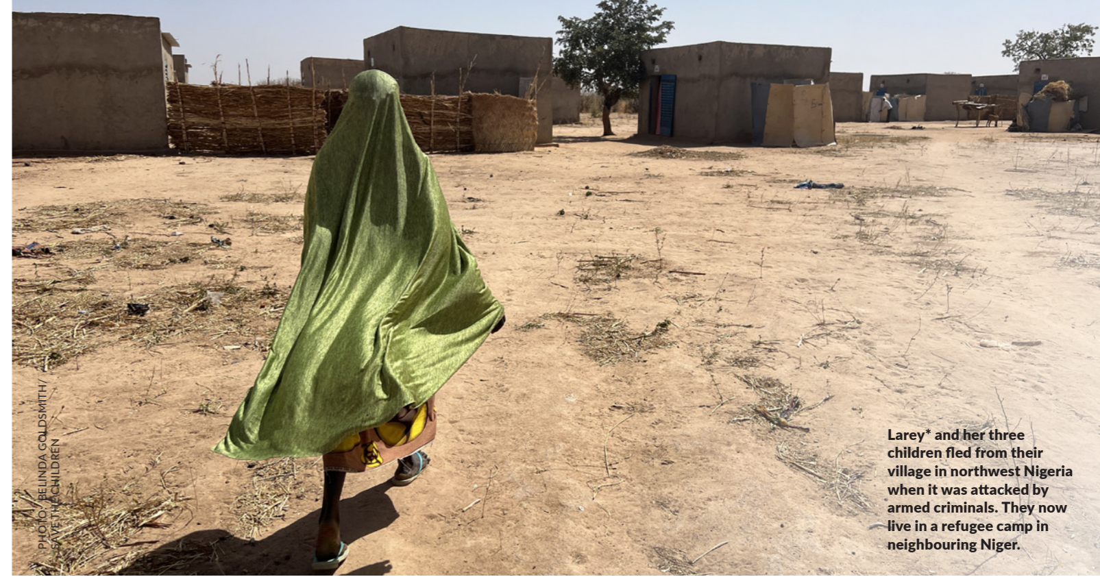
Larey* and her three children fled from their village in northwest Nigeria when it was attacked by armed criminals. They now live in a refugee camp in neighbouring Niger.

Over a quarter of education pledges made reference to equity. 66 Gender was the primary equity consideration, with 22% of all pledges explicitly addressing gender, including a focus on women and girls, gender sensitivity and gender disaggregated data. The Governments of Australia, Kenya, South Sudan and Sweden all committed to gender-sensitive education provision in their pledges. Just 4% of pledges addressed children and people with disabilities.