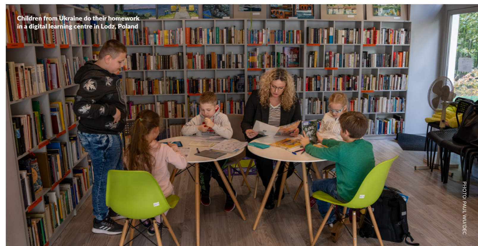
Children from Ukraine do their homework in a digital learning centre in Lodz, Poland

Although the way existing resources are used to further educational outcomes could be improved, fundamentally education needs more funding if we are to achieve the aims set out in Sustainable Development Goal 4, to ensure inclusive and equitable quality education and promote lifelong learning opportunities for all. The Education Commission found that under the most optimistic scenarios of domestic resource mobilisation and increased aid, there would still be a gap of at least US$20 billion by 2030. This is especially true for lower-income refugee-hosting countries, where the burden on already under-resourced education systems is the greatest.