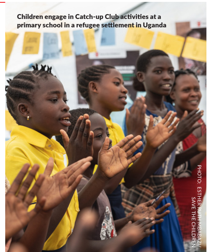
Children engage in Catch-up Club activities at a primary school in a refugee settlement in Uganda

Catch-up Clubs have had significant effects on literacy outcomes. Results from an evaluation in refugee settlements in Uganda showed that 85.9% of the children who attended Catch-up Clubs improved their reading by one level in contrast to 25.7% of children who didn't. 36