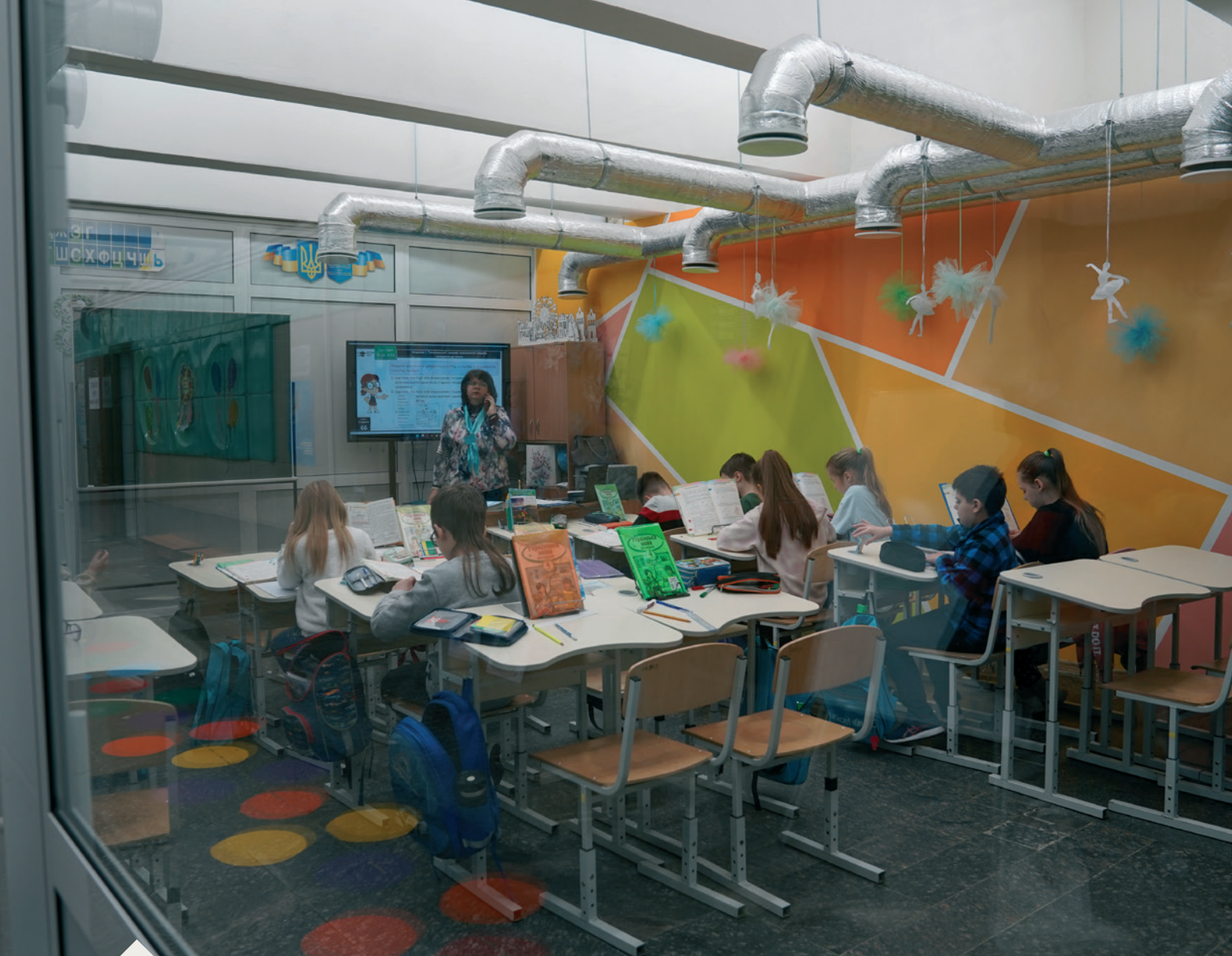
Primary school classroom in the Kharkiv underground school.

Children study in an underground school in Kharkiv.