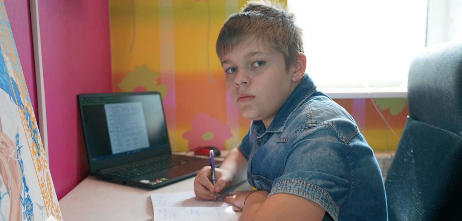
Anton*, 11, poses for portrait during online classes at his home in Mykolaiv region.

When asked what would improve their education, over half (53%) said that they needed “more interesting lessons”. They also said that they needed “equipment (e.g. laptops or tablets)” (44%) and that their damaged schools need to be repaired and fitted with protective shelters (39%).