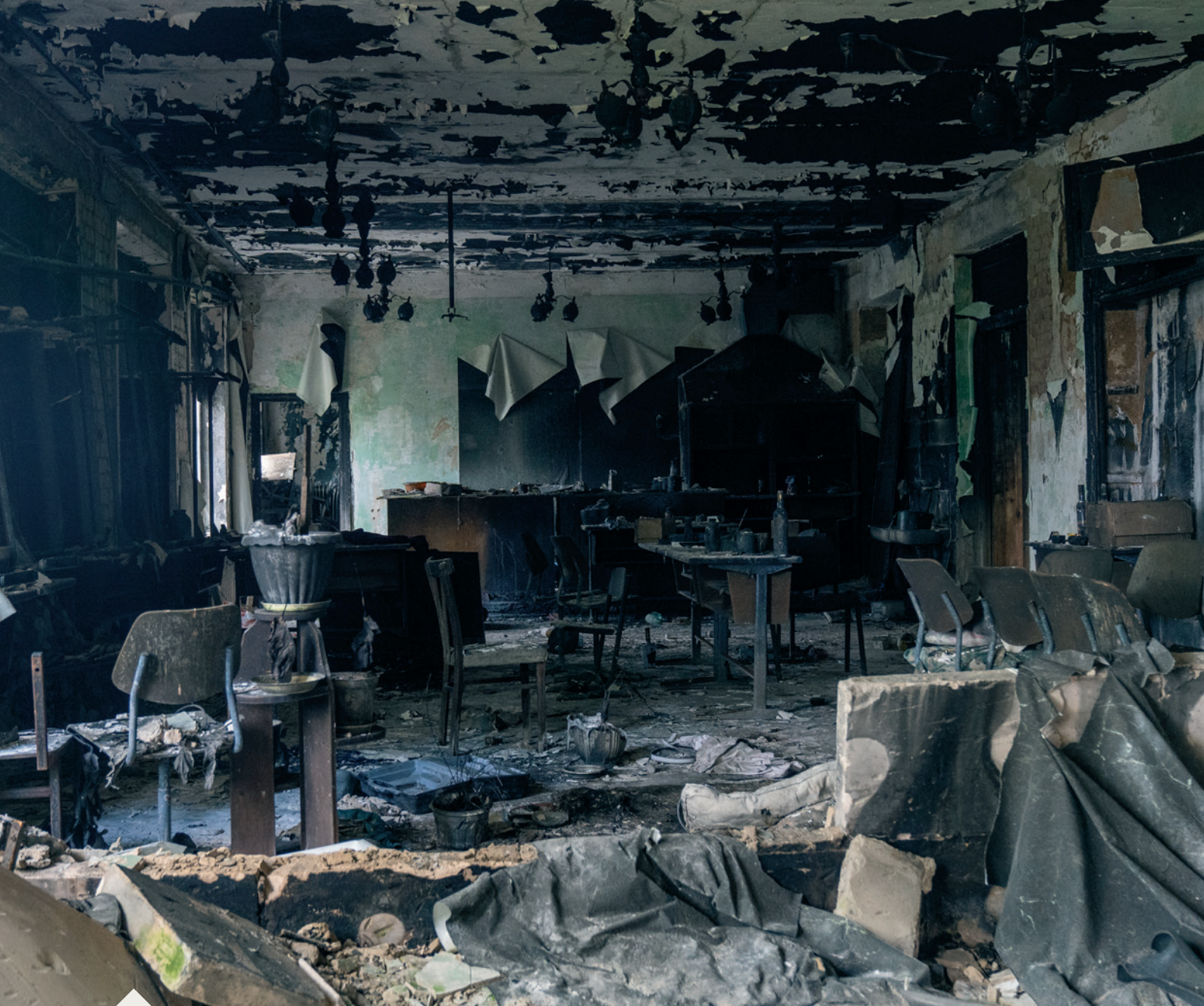
Interior of the damaged school outside of Kyiv.